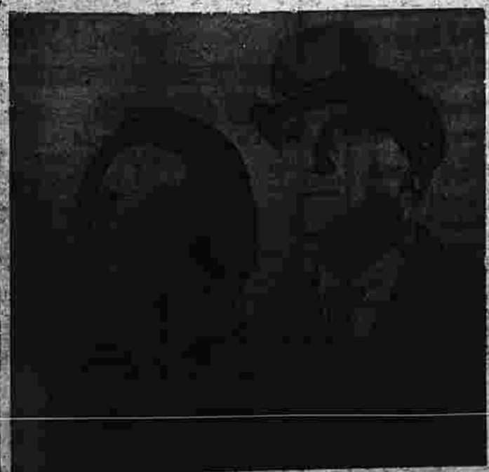
MORE SPIES — Patrick Macnee and Diana Rigg star in the newest secret agent series, "The Avengers" premiering Monday evening at 10 on Channel 8. Macnee plays John Steed, a tough, witty, fashionable secret agent with Miss Rigg as his beautiful aide, Emma Peel. The series has been a hit in England for several months.